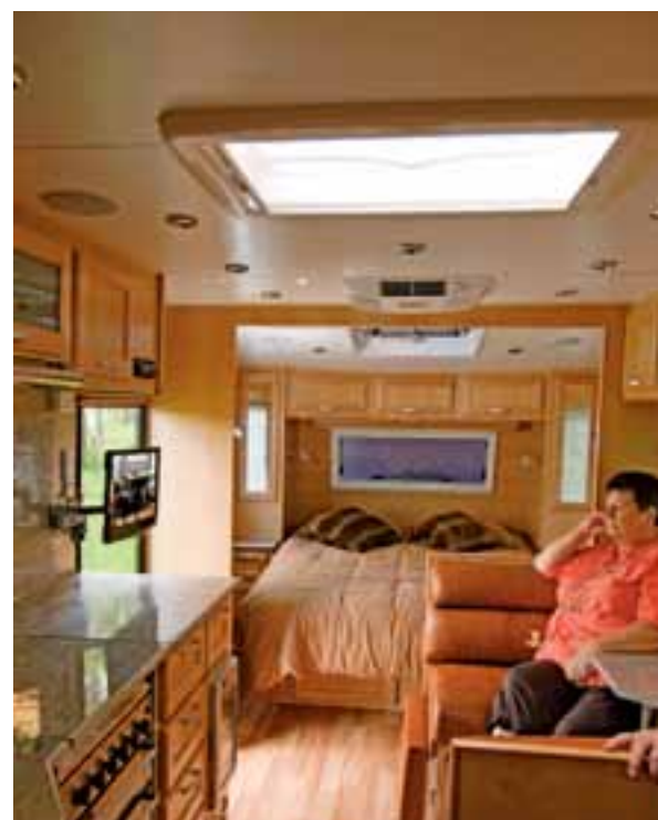
Above: Watching the telly in your van has never been easier. Left: New model. Below: The previous version of the Signal Finder.

plugged the lead into the VHF, where we received only four LEDs, but the antenna position was still optimal.